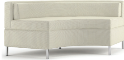
FA 1/4 Circle