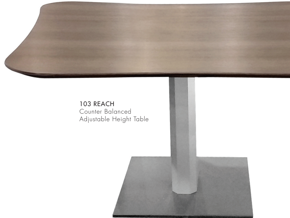
103 REACH Counter Balanced Adjustable Height Table