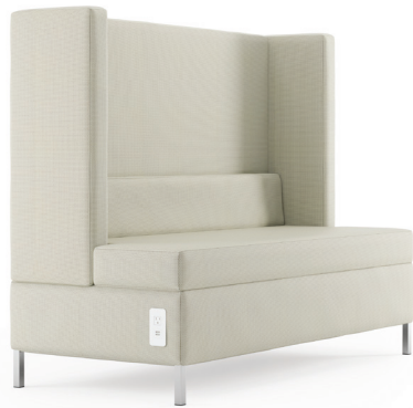
FA High Back Booth