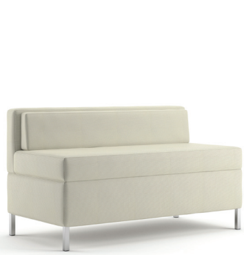
FA Single Booth

FIFTH AVENUE COLLECTION falconproducts.com