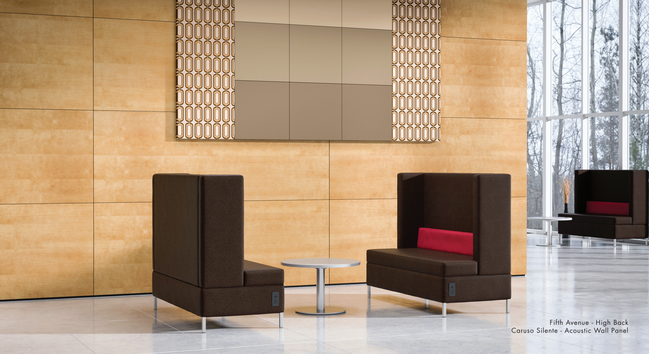
Fifth Avenue - High Back Caruso Silente - Acoustic Wall Panel