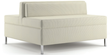
FA Double Booth