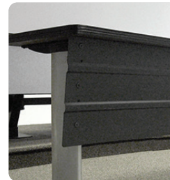
Solid Steel Panel