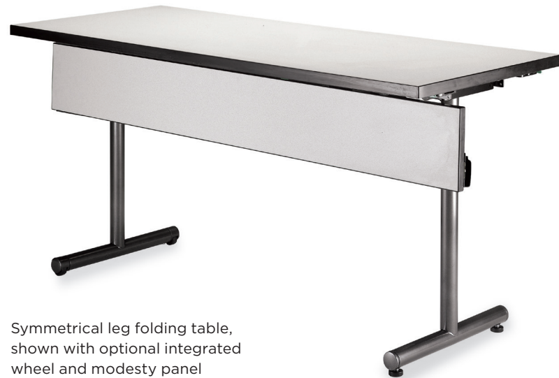
Symmetrical leg folding table, shown with optional integrated wheel and modesty panel