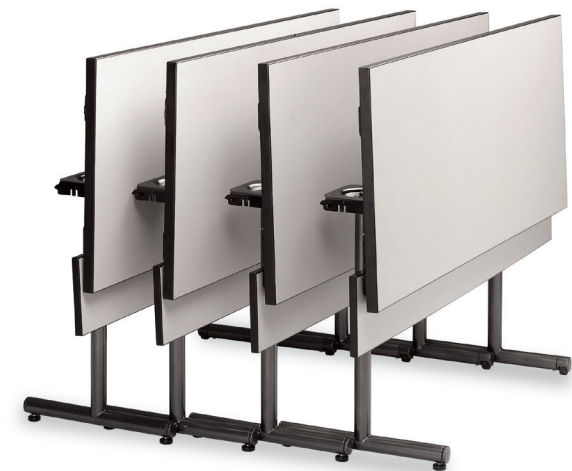
Nested ST6X Flip Top Table

Storm Wheel Leg with integrated wheel option