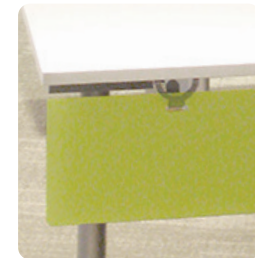
Acrylic Panel *Not available curved