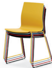
G-303 Sled Base Chair