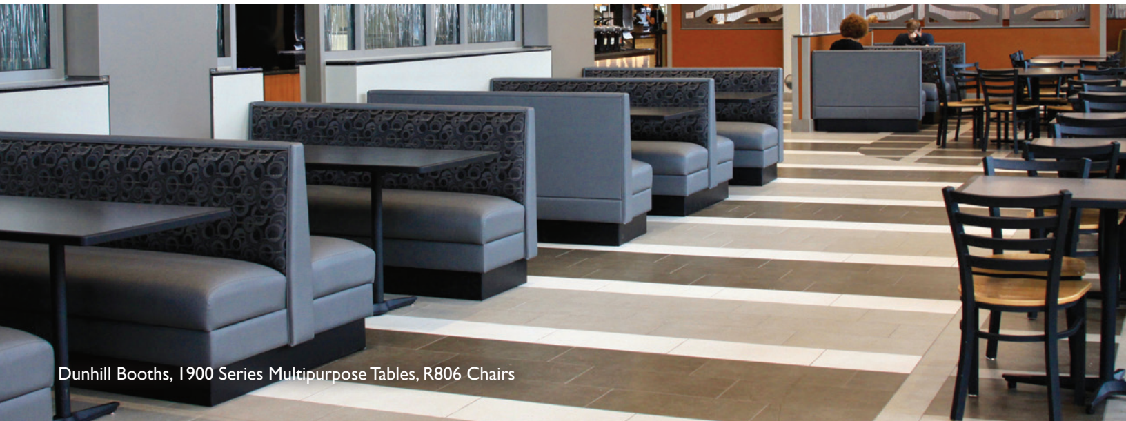
Dunhill Booths, 1900 Series Multipurpose Tables, R806 Chairs