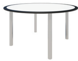
PL23 Work Table

Available in variety of heights and shapes.