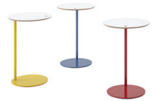
Lolli-Top Personal Laptop Tables

Available in a variety of heights. Shown with optional power.