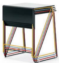
G-315 Student Desk

Sedera seating is available in choice of ten fun shell colors with matching or contrasting frame finishes. Upholstered seat and back optional.