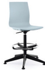
G-313 Drafting Stool