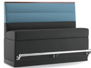
Newbury Standing Height