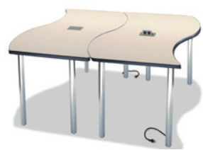
CURV Wave Community Table

Available in variety of heights and shapes.