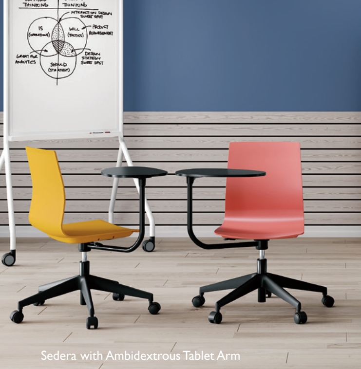
Sedera with Ambidextrous Tablet Arm