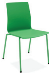
G-301 Side Chair