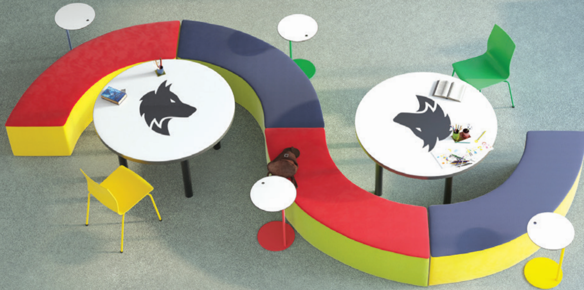
Sedera Chairs, Lolli-Top Personal Tables, PL23 Work Tables, MOSS 3 Modular Seating