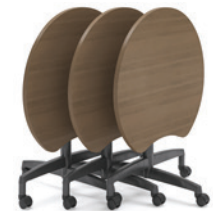
Wander Personal Work Table

Available in wide variety of base colors. White top with 1" finger hole is standard.